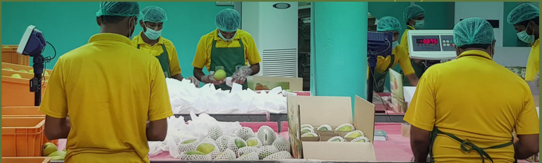
Hot water Treatment Plant

In order to reach high end markets of the World (China, Iran, Japan, Australia, New zeland) we are striving to meet WTO/HACCP/ISO and SPS requirements. For the said purpose, we have available facilities of hot water treatment (HWT), vapour heat treatment (VHT) and irradiation.