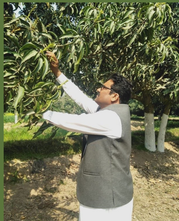
Regular Checkups by govt. authorities